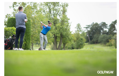
Drive visitor revenue without impacting members