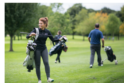
Stay informed about club news and competition results