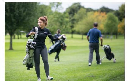
Stay informed about club news and competition results