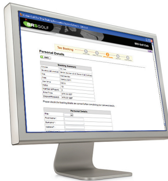
Personal Details Recorded Automatically