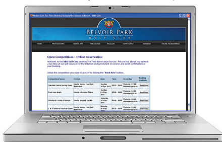
Open Competitions Page

BRS firmly believe that any club that does not offer tee times for sale online is missing out on significant potential revenue and an invaluable marketing database.