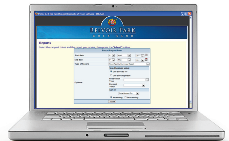
Booking Report Screen